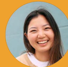
Pia Park Intern